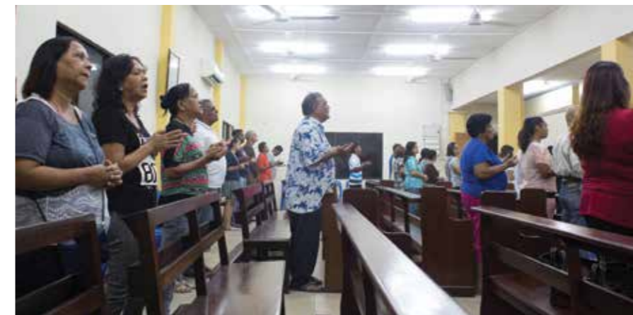
(Top) Religious festivals are part of life in the predominantly Catholic Eurasian community of Malacca's Portuguese Settlement. Pictured here is the celebration of Festa San Pedro or Saint Peter's Festival. Saint Peter is the patron saint of fishermen. Some men of the community carry a statue of the saint to the shore to bless the fishing boats.

At intervals during the service, my eyes drift to the window. The early morning light bathes the brick wall beyond in a