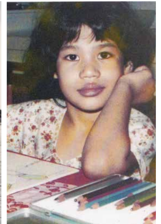
[Left] On the shores of the Portuguese Settlement in Malacca, where many of the Portuguese-Eurasian residents used to be fishermen. Photo by Desmond Lui. Courtesy of Melissa De Silva. [Above] The writer at about five years of age. Courtesy of Melissa De Silva.